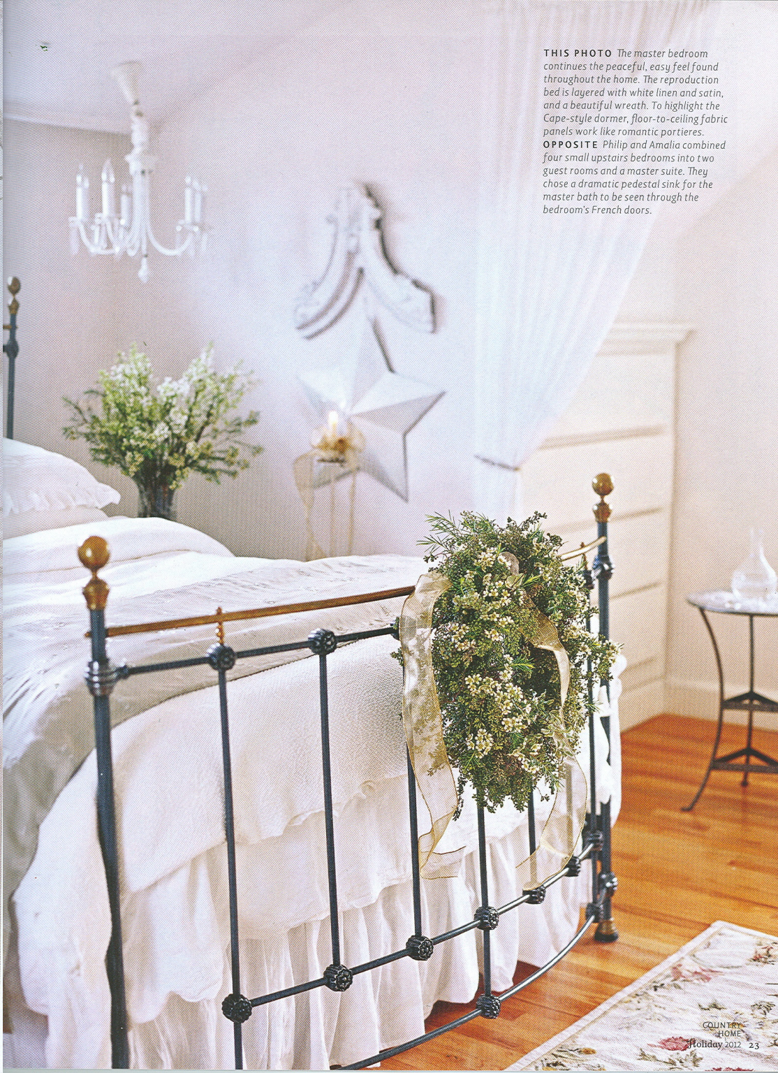
THIS PHOTO The master bedroom continues the peaceful, easy feel found throughout the home. The reproduction bed is layered with white linen and satin, and a beautiful wreath. To highlight the Cape-style dormer, floor-to-ceiling fabric panels work like romantic portieres. OPPOSITE Philip and Amalia combined four small upstairs bedrooms into two guest rooms and a master suite. They chose a dramatic pedestal sink for the master bath to be seen through the bedroom's French doors.