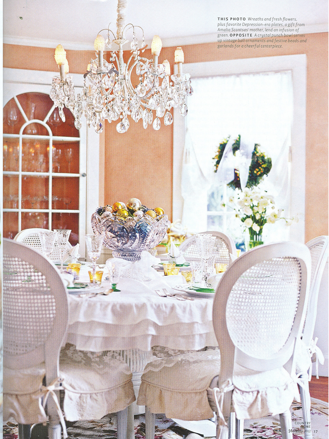
THIS PHOTO Wreaths and fresh flowers, plus favorite Depression-era plates, a gift from Amalia Scontsas' mother, lend an infusion of green. OPPOSITE A crystal punch bowl serves up vintage ball ornaments and festive beads and garlands for a cheerful centerpiece.